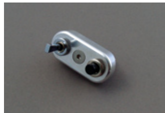
The most basic type machined from billet aluminum.