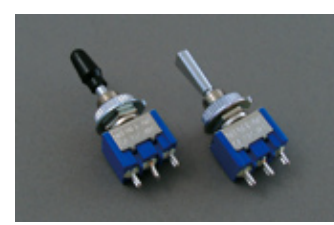
Two different looks for both manual and automatic type.