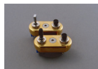
Matches classical-looking custom building.