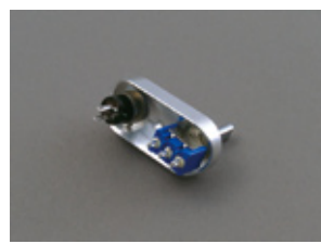
Bottom of this product. It may be required to put a part of the switch unit into the inside of a handle pipe.